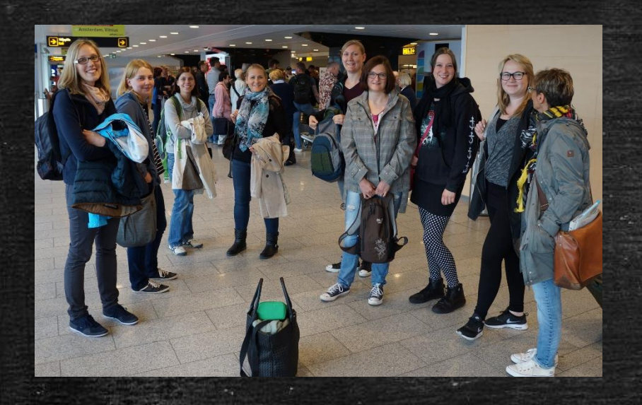
...arriving in Tallinn...