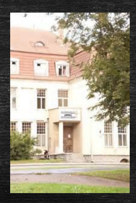
Fat Margaret's Hostel