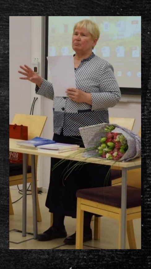
Head of the faculty